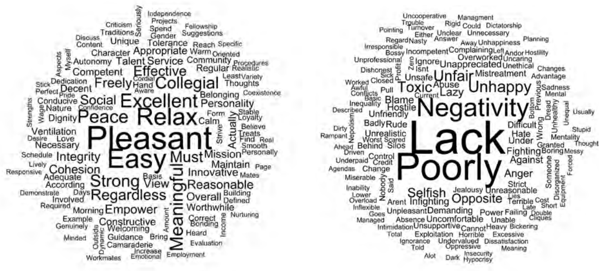
Figure 3: Left: Words employees use to uniquely describe ‘good culture.’ Right: Words employees use to uniquely describe ‘bad culture.’

An employee who participated in a focus group in Sydney, Australia may have provided one of the best summaries for what workplace culture is all about. She defined culture as, “The sort of things that the company provides that you don’t think are big things, but they actually play a big part in keeping people.” In the end, culture is a culmination of a lot of factors that ultimately retain your current employees, engage them in great work, and make your organization a magnet for new talent.