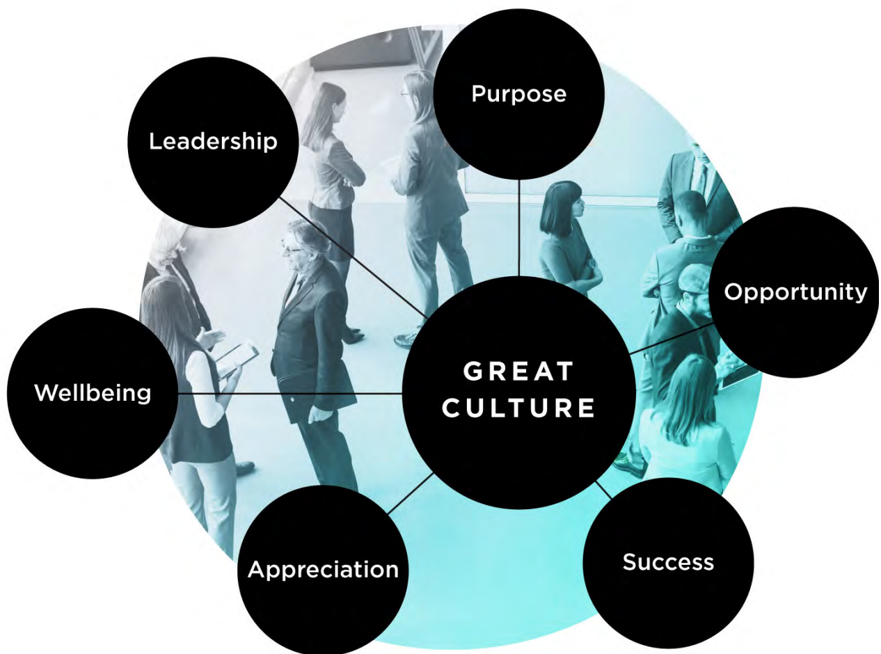
Figure 4: The six aspects of great culture that are most important to employees.